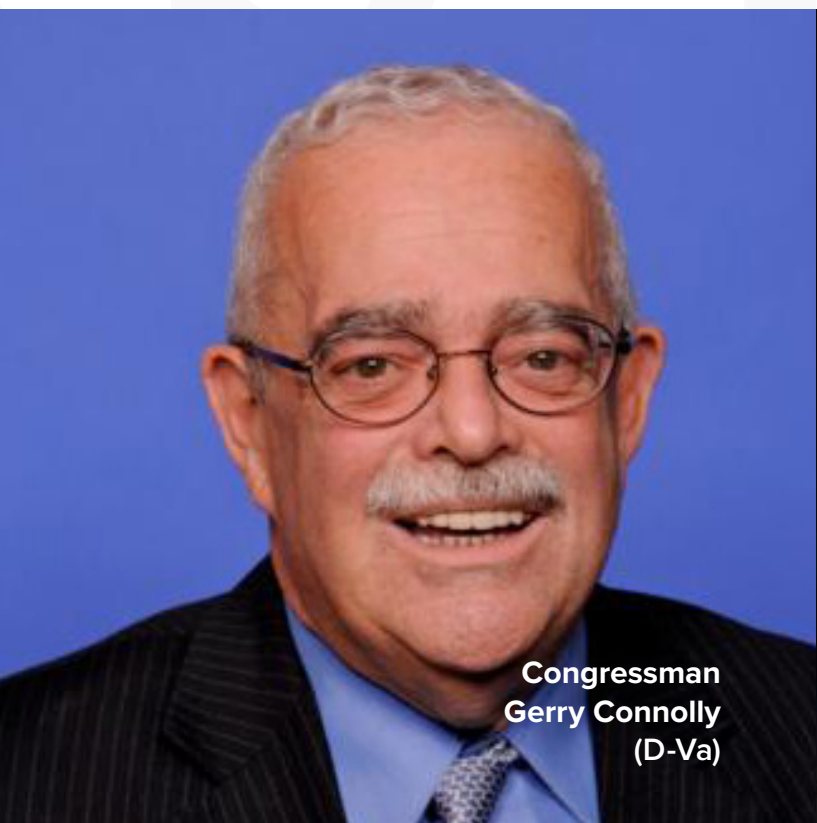
Congressman Gerry Connolly (D-Va)