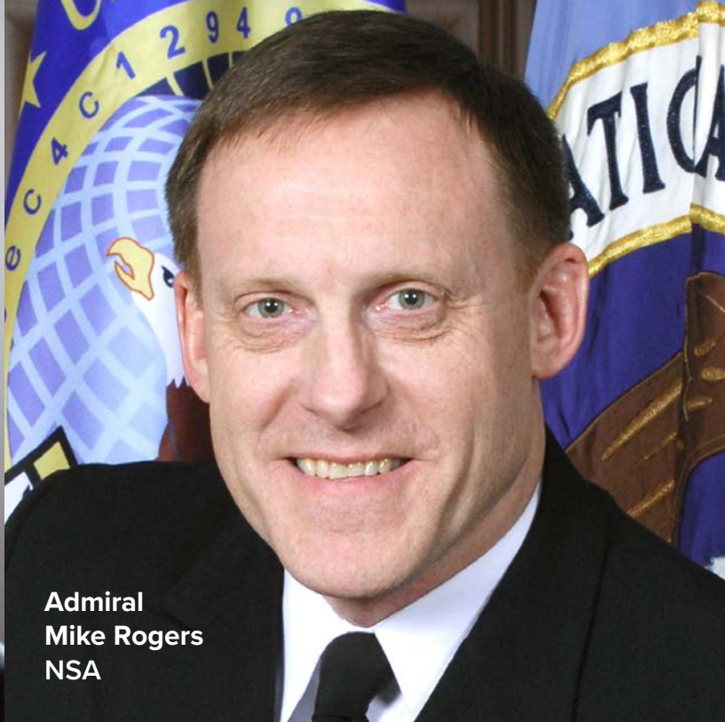
Admiral Mike Rogers NSA