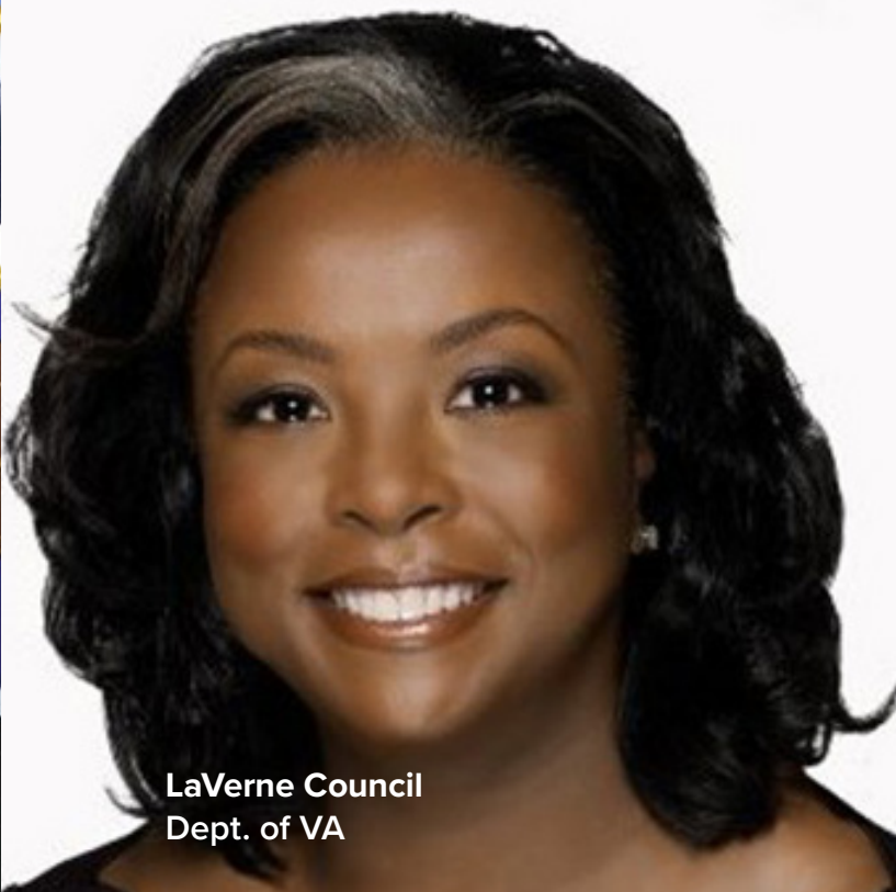
LaVerne Council Dept. of VA