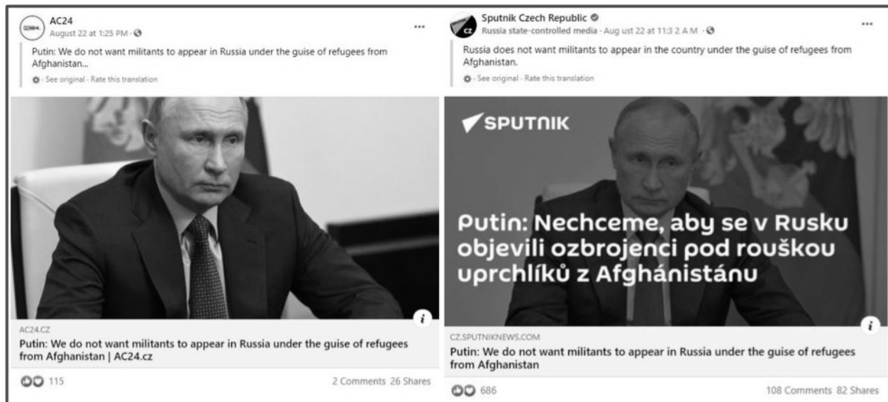
Example of AC24.cz republishing an article from cz.sputnik. Translated from Czech

The outlet AC24.cz most frequently reposted stories from cz.sputnik—26 of the 41 identified pairs. Analyzing the articles linked via Facebook posts, AC24 did not appear to ever directly cite cz.sputnik, only linking to cz.sputnik in the first line of the article. Moreover, we observed at least six instances where AC24 reposted an article from cz.sputnik and then claimed the source of the story was from another outlet, such as The Washington Post or Daily Mail . 25 Such activity appears to obfuscate how AC24.cz is sharing content from Russian state-funded media.