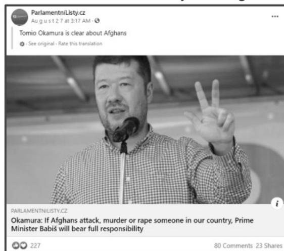
Facebook post from parlamentnilisty.cz shares statements from SPD Chairman Tomio Okamura

Only two of the 15 accounts provided coverage of the SPD Party—parlamentnilisty.cz and cz.sputnik— (22 and 14 posts, respectively)—which claims a “zero tolerance” for immigration. Both outlets reported sound bites from SPD chairman Okamura’s campaign: “we will sink the Pirates,” “Babiš bowed his head in front of Brussels, but SPD will not kneel” and “If Afghans attack, murder or rape someone in our country, Prime Minister Babiš will bear full responsibility.” 20 Additionally, cz.sputnik appears to have interviewed Okamura on 15 August. 21