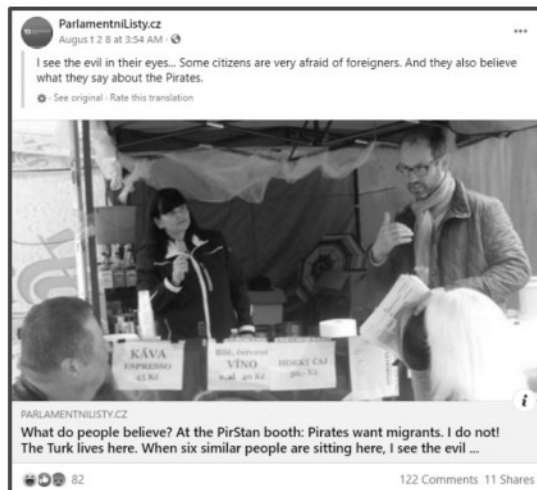
Facebook post from parlamentnilisty.cz criticizing the Pirates party's stance on migration. Translated from Czech.

TOP-09 chairperson Pekarová Adamová received negative coverage of her recent statement on wanting to accept "proven refugees." 12 One post claimed that Adamová wanted to "open the gates" for refugees. 13 Parlamentnilisty.cz also provided negative coverage of Adamová's statement that SPD chairman Tomio Okamura, "the descendant of a migrant, is against migration." 14 As we note below, the SPD Party appeared to receive favorable coverage from Parlamentnilisty.cz