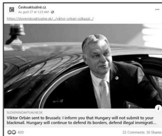
Facebook post from ceskoaktualne.cz lauding Hungarian Prime Minister Viktor Orbán's stance on migration. Translated from Czech.

Ceskoaktualne.cz provided especially provocative statements about Merkel, such as "Germany is becoming an Islamic country and Germans will have to get used to it." 19