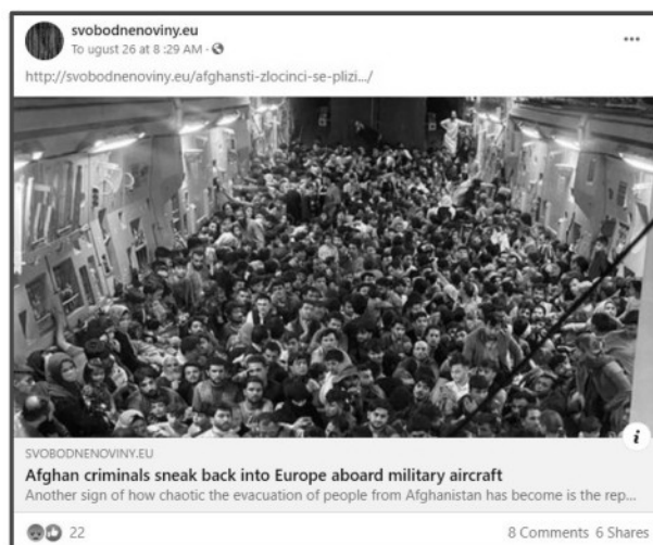
Example of misleading content from svobodnenoviny.eu. Translated from Czech.

We found instances of misleading content across the 15 outlets. Parlamentnilisty.cz quoted aggregate sexual assault stats from Sweden, next to the phrase “gangs of migrants”—falsely implying that immigrants were responsible. 22 Svobodnenoviny.eu published the headline “Afghan criminals sneak back into Europe aboard military aircraft” along with a highly-circulated image of 640 Afghan civilians being evacuated from Kabul in an U.S. C-17 plane. 23 On 6 August, Ceskoaktualne.cz posted an article claiming that a migrant attempted to kidnap an 11-year-old child. 24 The accompanying video—dated 6 August 2020—contains no footage of a kidnapping, just a man being attacked. This is likely an example of missing context, where an image is taken out of context to advance a narrative.