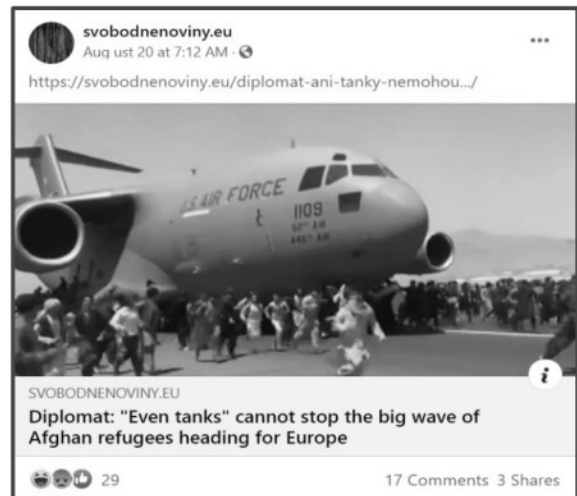
Facebook post from svobodnenoviny.eu warning of a wave of refugees. Translated from Czech.

Thirty-five posts included coverage of Belarus sending migrants to neighboring countries, and the respective responses from Poland and Lithuania. 5 Posts tended to cast the situation as threatening to the Czech Republic, using phrases such as “flooded with immigrants” and “rough welcome.” 6 The outlet eportal.cz took an especially fear-mongering tone, alleging: “If the masses of refugees manage to break the Polish border, we can quickly wait for them on our territory.” 7